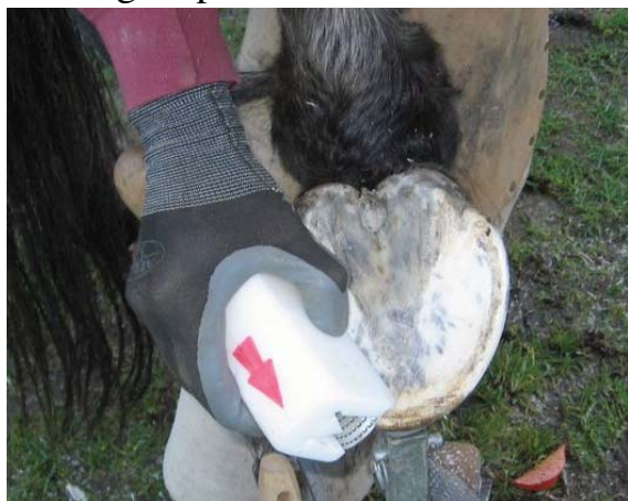
Moving rasp in direction of arrow: