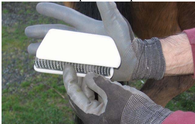
Heel of hand ‘pushes’ rasp: